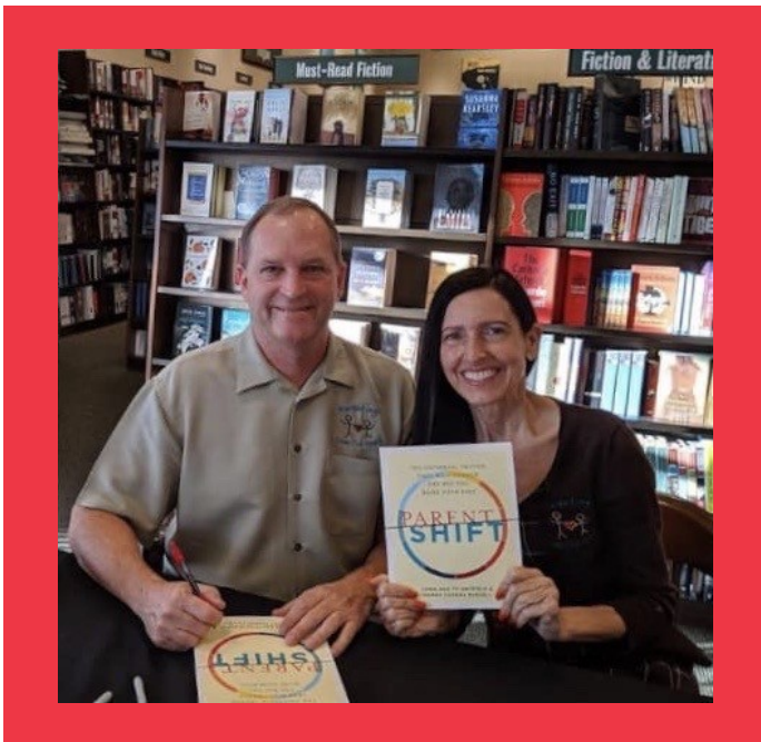
Co-Authors of ParentShift: Ten Universal Truths That Will Change The Way You Raise Your Kids