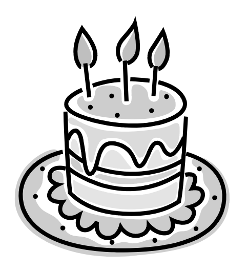
BIRTHDAYS (Past, Present and Pretend)